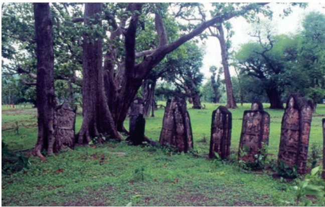
Fig. 8.15. From the sacred groves of the Bhils