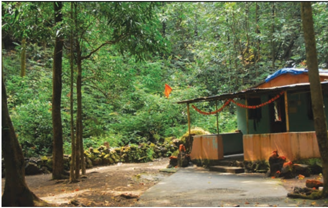
Fig. 8.13. Kalkai temple, Mulshi, Maharashtra