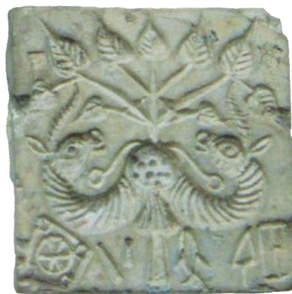
Fig. 8.12. A seal from Mohenjo-daro

Observe this seal from Mohenjo-daro. Can you recognise the leaves at the top? As you can see, the peepul tree has been an important part of India's cultural geography for millennia.