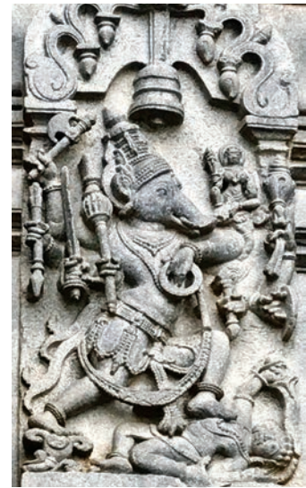
Fig. 8.5. In this image, Viṣṇu in the form of his boar avatar crushes a demon and saves Bhūdevī (Mother Earth), shown here sitting on his elbow (from the Belur temple, Karnataka)

This tradition comes from the perception of a divine presence in all of Nature. Ultimately, the whole of planet Earth is considered sacred — she is Mother Earth or Bhūdevī.