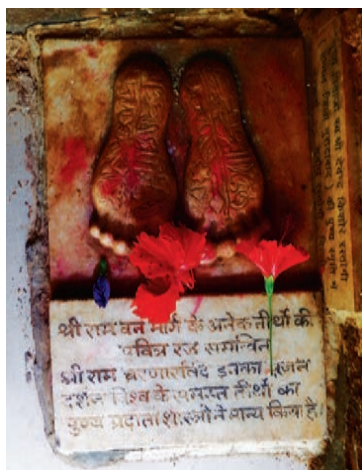
Fig. 8.11. A shrine in Bastar, Chhattisgarh, celebrating Rāma's passing through the area