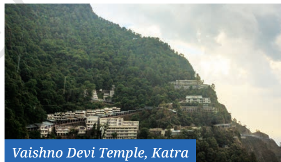
Vaishno Devi Temple, Katra