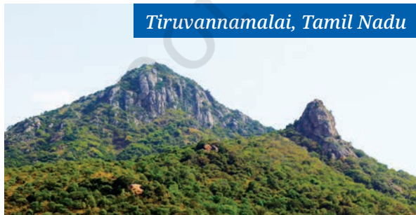
Tiruvannamalai, Tamil Nadu