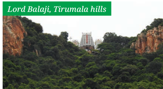
Lord Balaji, Tirumala hills