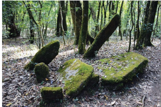
Fig. 8.14. Mawphlong, Shillong