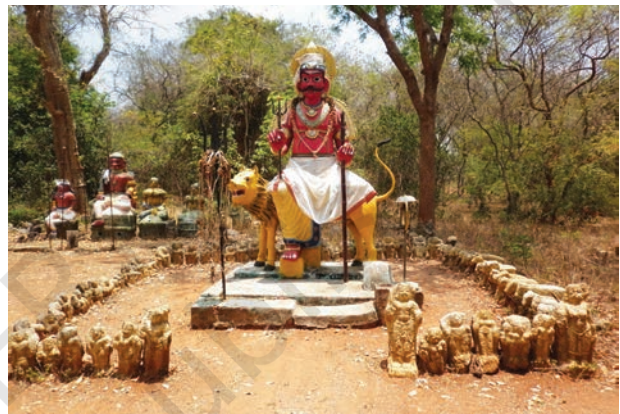
Fig. 8.16. Udaiyankudukadu Karumbayiramkondan, Tamil Nadu

Given below are the names of a few sacred groves in a few regional languages of India. Can you add to this?