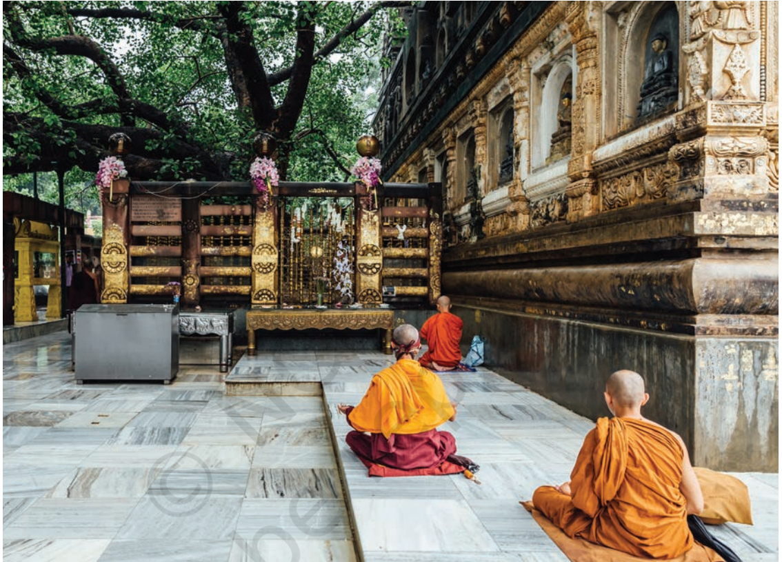
Fig. 8.10. The tree in the Mahabodhi Temple at Bodh Gaya is often cited as a direct descendant of the original tree under which, according to Buddhist tradition, the Buddha attained enlightenment — hence the names ‘bodhi tree’ and ‘Bodh Gaya’.

In many parts of India, trees are adorned with offerings like turmeric and kumkum . One species of fig tree commonly called ‘peepul’ (or ‘pipal’), ‘bo tree’ or ‘bodhi tree’ ( aśvattha in Sanskrit) is sacred to Hinduism, Buddhism, Sikhism and Jainism. In fact, its botanical name is Ficus religiosa (literally, in Latin, the ‘religious’ or sacred fig tree).