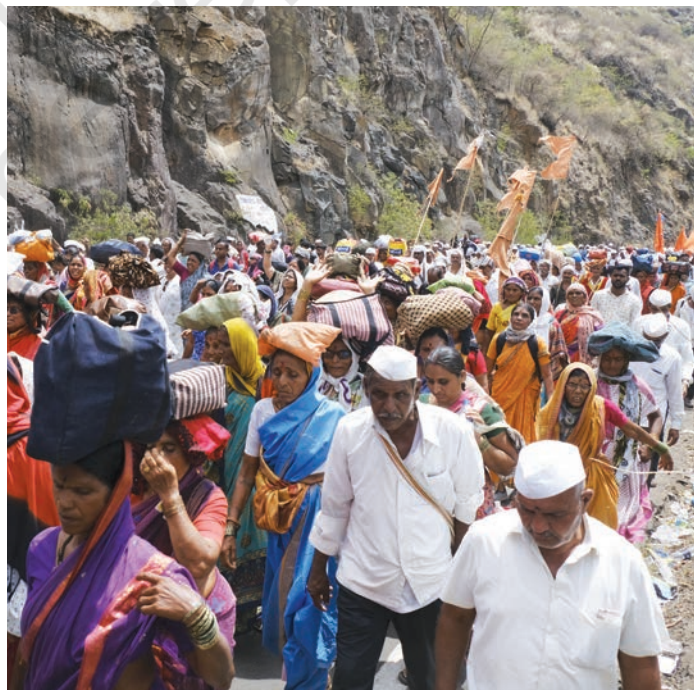
Fig. 8.4. Pandharpur wārī, an 800-year-old tradition in Maharashtra. Wārī means a pilgrimage that is held regularly, in this case annually. Pilgrims walk in large groups for 21 days to the famous Vithoba temple in Pandharpur.

Tirthankara: Literally, someone who makes a tīrtha , that is, who guides the crossing from ordinary to higher life. In Jainism, the Tirthankaras are the supreme preachers of dharma.